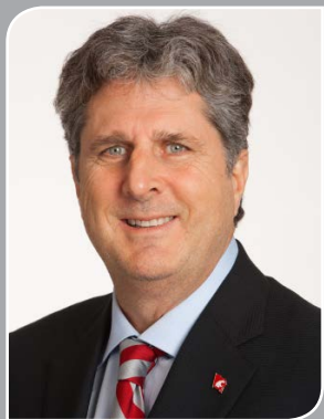
Mike LEACH Head Coach 5th Year

Mike Leach, the 2015 Pac-12 Co-Coach of the Year, begins his fifth season leading the Washington State Cougar football program after being named the Cougars' head football coach, Nov. 30, 2011. Leach has guided the Cougars to two bowl appearances in his first four years, a first for a WSU head coach.