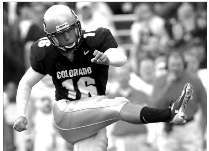
PK Mason Crosby