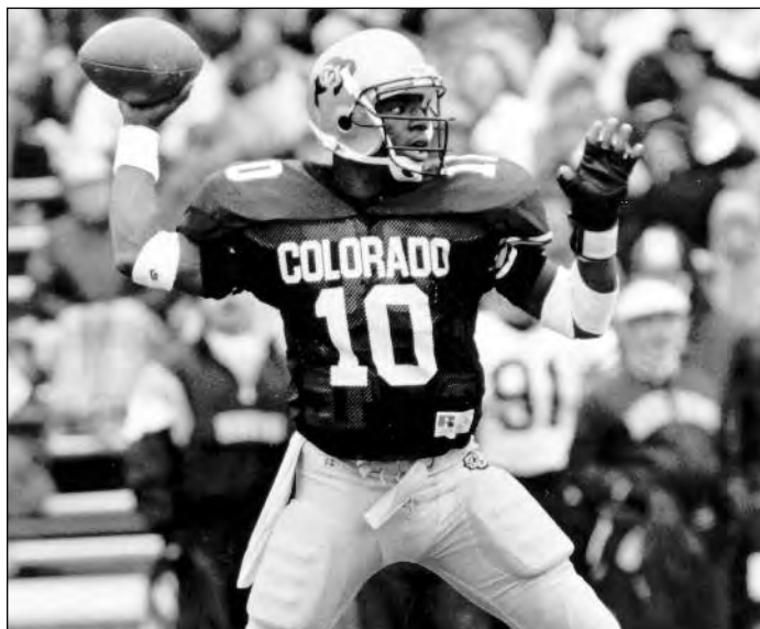
QB Kordell Stewart