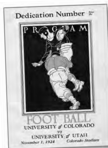
Official game program from 1924 homecoming versus Utah.

DID YOU KNOW . . . That despite not having beaten a No. 1 team, Colorado twice knocked Oklahoma out of the No. 1 slot? CU's efforts in 1957 and 1975 knocked the Sooners from No. 1 to No. 2 in the AP poll. And in 2001, CU defeated Nebraska, 62-36; the Huskers were ranked No. 3 by the AP, but were in fact the No. 1 team ... in the BCS Standings going into the game.