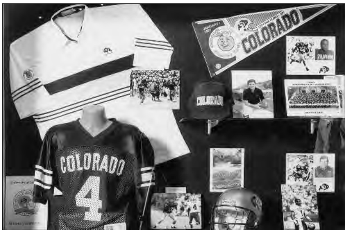
CU's National Title Display at the College Hall of Fame