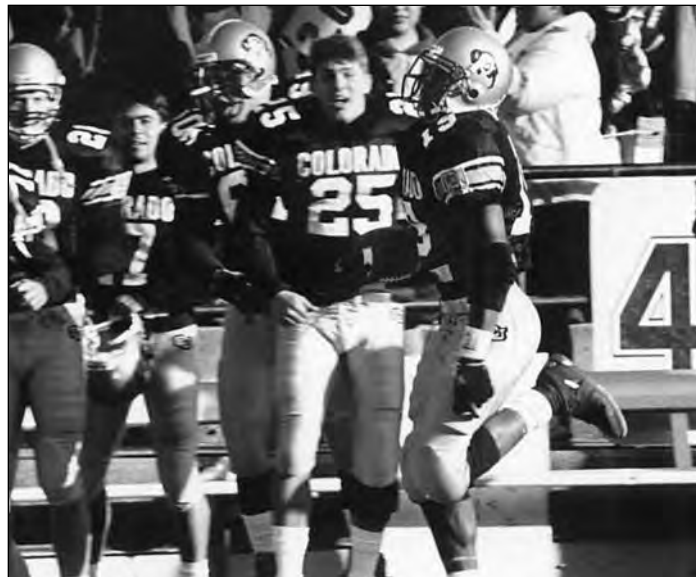
Rashaan Salaam on his way to 2,000-plus yards versus Iowa State in 1994.

Throughout its history, University of Colorado football fans have been treated to some special moments the last time a player or coach took the field for the Buffaloes, either in the final game of the regular season or in a bowl game. Here's a look at a few of these that stand out: