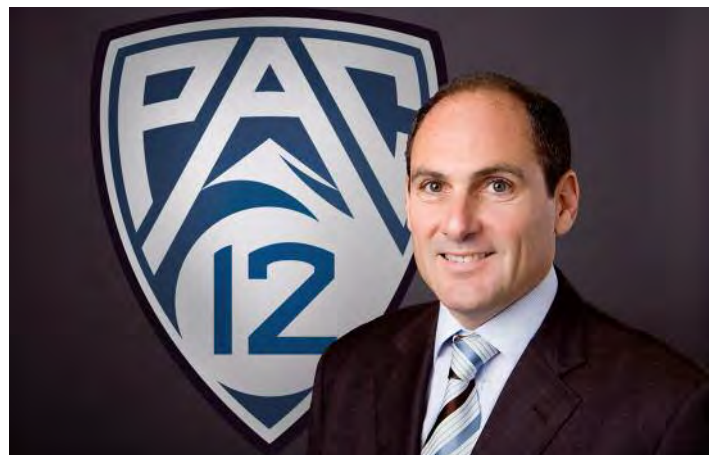
Pac-12 Commissioner Larry Scott

Colorado accepted its invitation to join the Pac-12 on June 11, 2010, as the Buffaloes were the first domino to fall in a change of the national landscape which, in just one week, saw Nebraska also leave the Big 12 and join the Big 10, Boise State depart the WAC for the Mountain West, TCU jump from the MWC for the Big East (before eventually landing in the Big 12). Less than a week later on June 17, Utah agreed to join CU to make it an even dozen in the Pac-12. Big-time rivals for the first half of the last century, the Buffaloes and Utes officially became the 11th and 12th members of the Conference on July 1, 2011, the first additions to the league since 1978. During the 33 years between expansions, Pac-10 teams claimed 258 NCAA titles (130 women's, 128 men's).