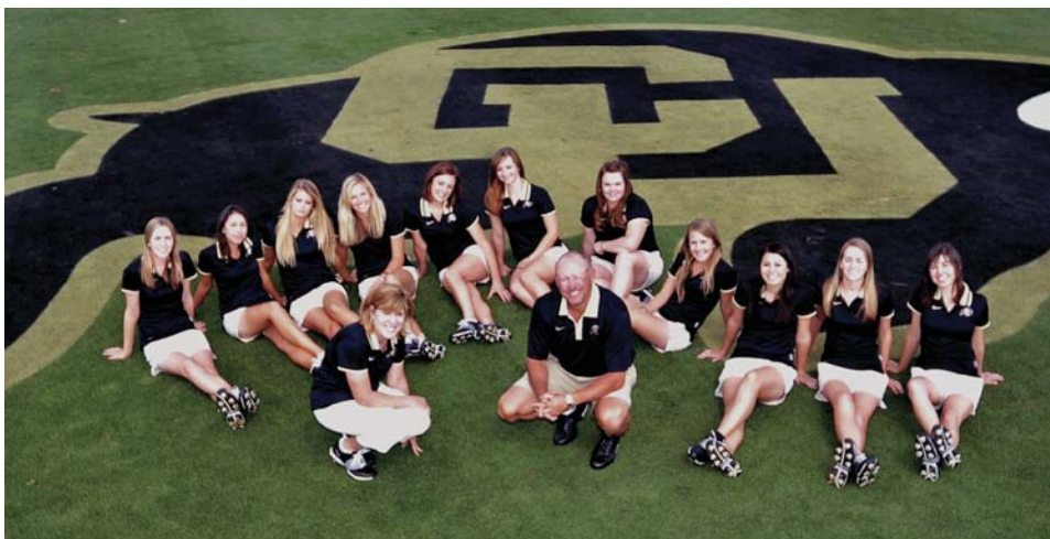
The 2011-12 team set seven team records, including stroke average.