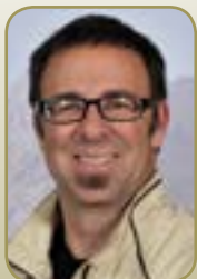
Tim Horton Equipment