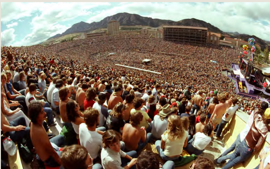
The Rolling Stones packed Folsom Field in 1981