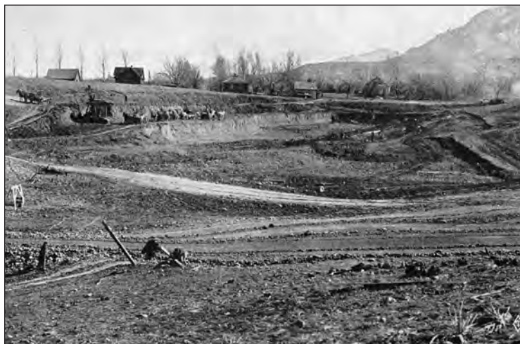
The beginning of work on the stadium in January, 1924.

The renovation of CU's team house in the summer of 1979 took away a few seats, changing the capacity to 51,463. The