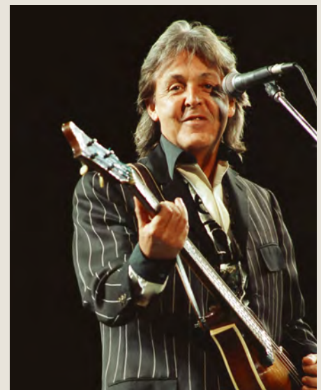
Paul McCartney played Folsom in 1993