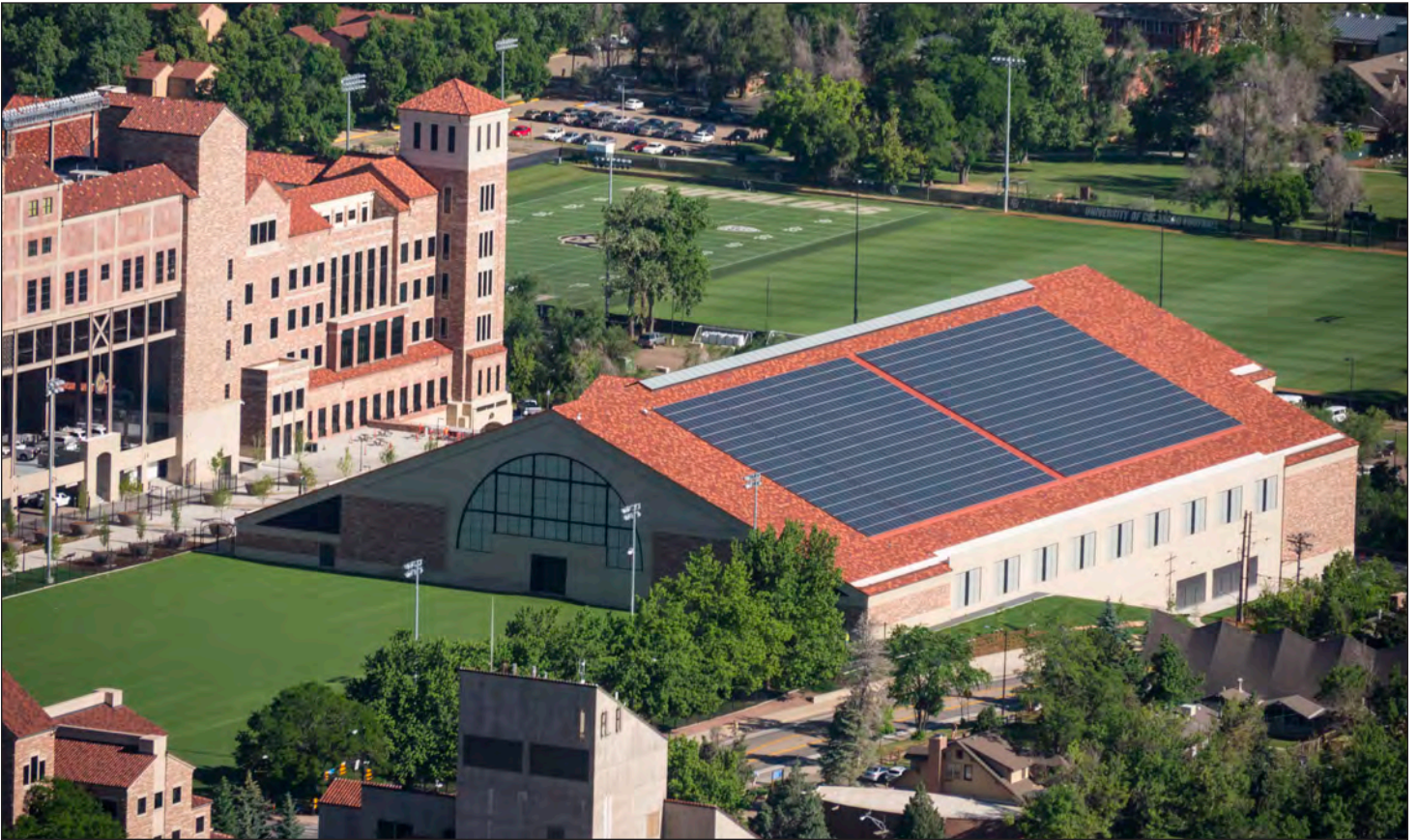
Aerial view of CU's Indoor Practice Facility, with the new Champions Center to its left.

The following people/families sponsored major areas in the Champions Center or upgrades in the Dal Ward Athletic Center ( all in the Champions Center unless noted; as of August 1, 2019 ):