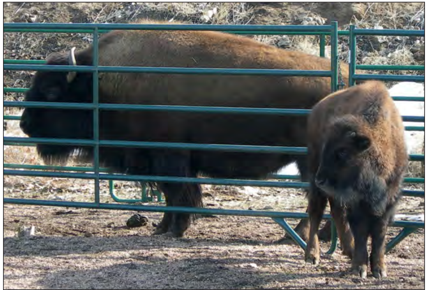
Ralphies IV and V together in November 2007