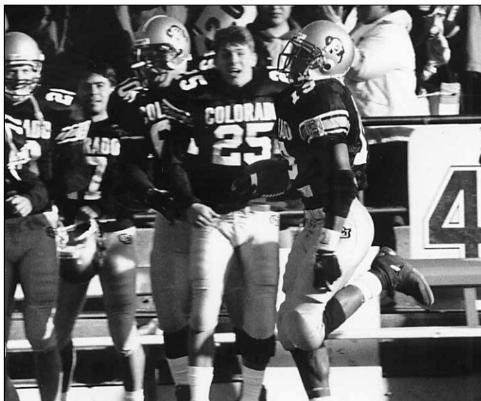
Rashaan Salaam on his way to 2,000-plus yards versus Iowa State in 1994.