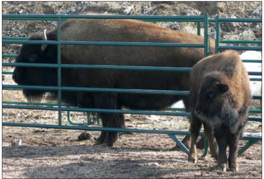
Ralphies IV and V together in November 2007

Ralphie IV was donated to the university by media and sports entrepreneur Ted Turner in 1998. Born in April 1997 on the Flying D Ranch in Gallatin Gateway, Montana, which is a part of Turner Ranches, she was named “Rowdy” by ranch hands. She was separated from her mother when she was about a month old and was literally found in the jaws of a coyote with bite marks around her neck. She survived the attack and was bottle-fed by the hands for four months. She was released back to the herd but wouldn’t bond with them, so the ranch hands took her back in and fed her grasses and grain. It was then that she was donated to CU as a yearling early in the spring of 1998.