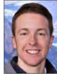
Mac Brown Health & Performance