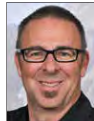
Tim Horton Olympic Sports Equipment