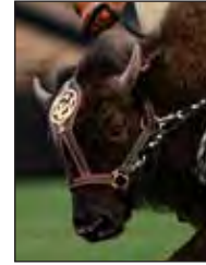
Ralphie Live Mascot