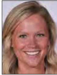
Abbey Shea Compliance