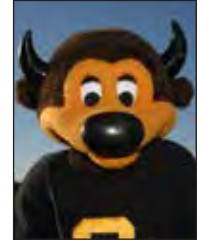
Chip Costumed Mascot