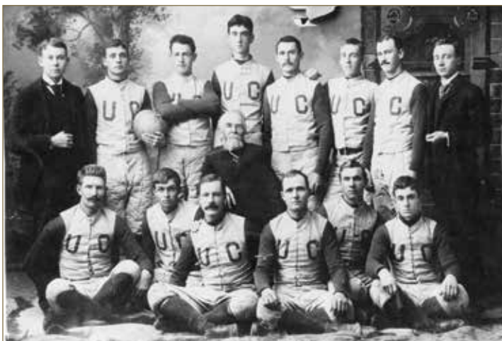
The 1891 team that recorded CU's first win