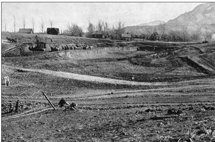
The beginning of work on the stadium in January, 1924.

The renovation of CU's team house in the summer of 1979 took away a few seats, changing the capacity to 51,463. The