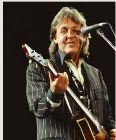
Paul McCartney played Folsom in 1993