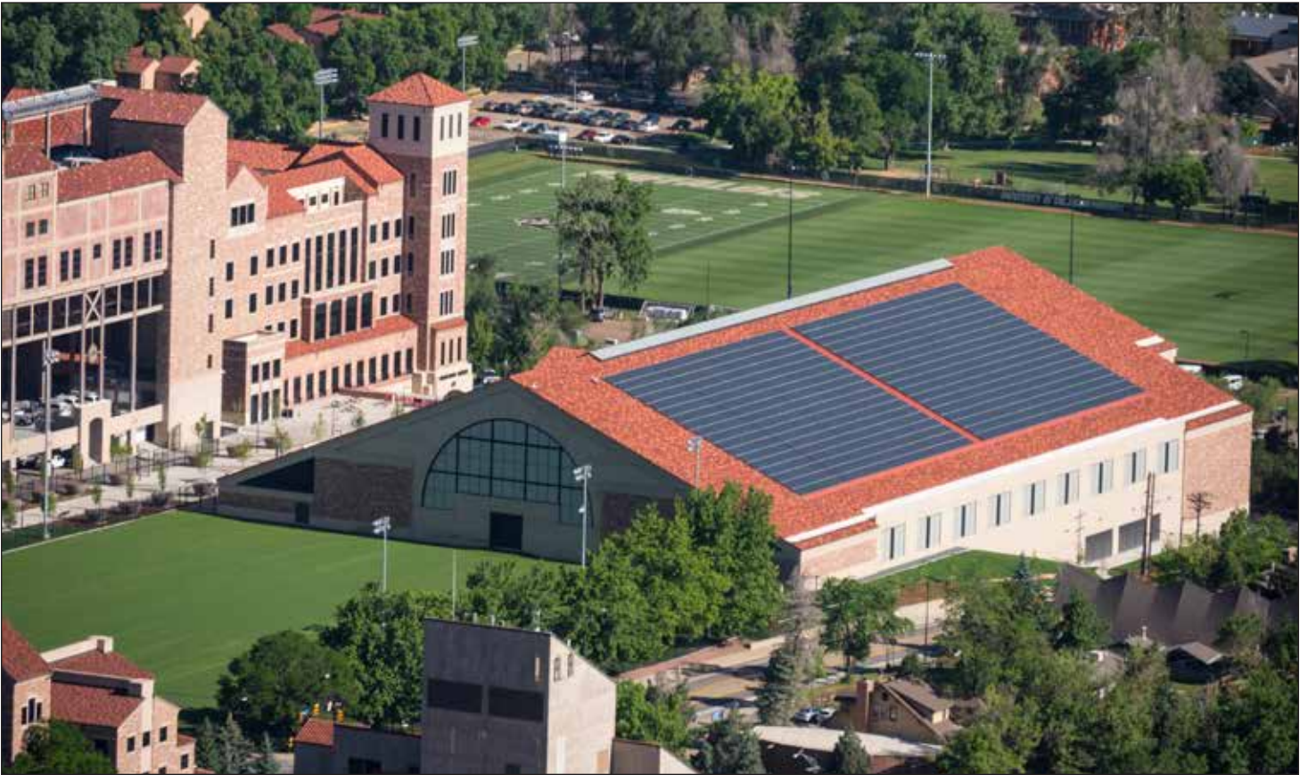
Aerial view of CU's Indoor Practice Facility, with the UCHealth Champions Center to its left.

The following people/families sponsored major areas in the UCHealth Champions Center or upgrades in the Dal Ward Athletic Center ( all in the Champions Center unless noted; as of August 1, 2021 ):