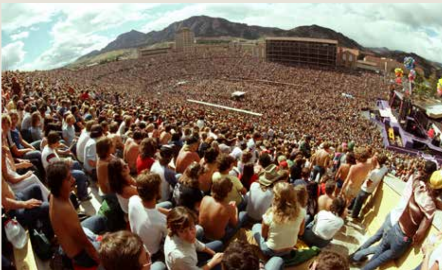
The Rolling Stones packed Folsom Field in 1981