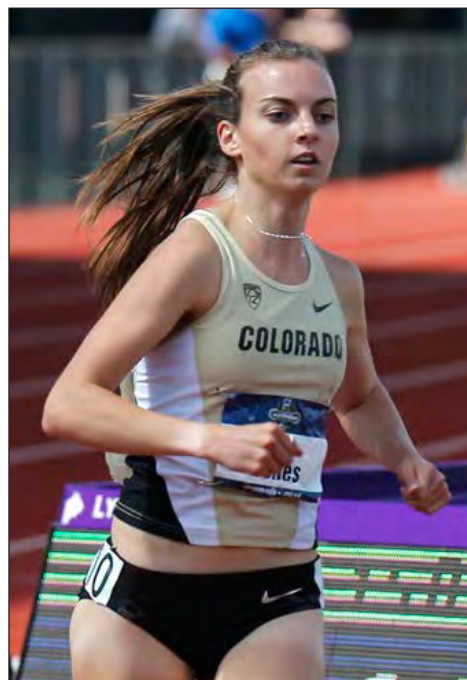
Dani Jones was the 2017 national champion in the indoor 3,000-meter run.