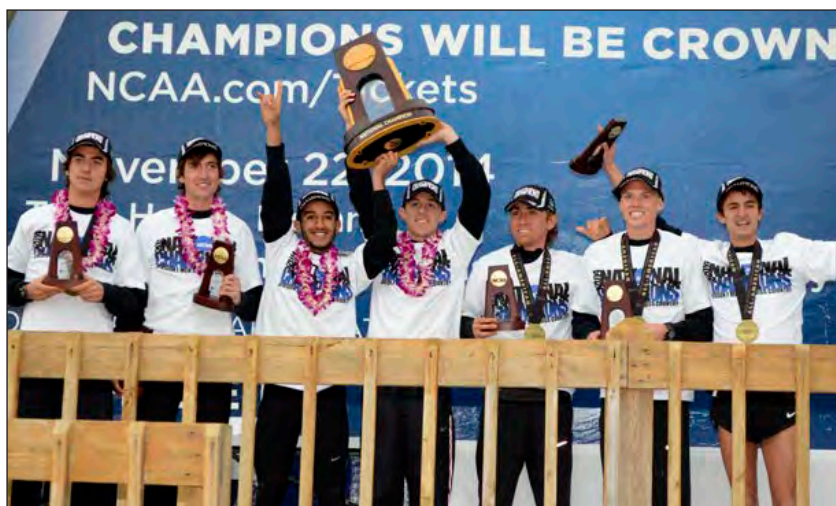
CU won back-to-back men's NCAA cross country titles in 2013 and 2014.

While Colorado did not win an NCAA title in 2017-18 and the school's count remains at 27, the Buffaloes finished second in skiing, third in women's cross country (eighth in men's) and 19th in women's golf. CU has won 20 skiing titles (11 men's, one All-American women's and eight coed) and seven cross country (five men's, two women's); the Buffs also were the consensus national champions in football in 1990, but since it is not an NCAA-sanctioned championship, it doesn't count toward the Pac-12's total of 513.