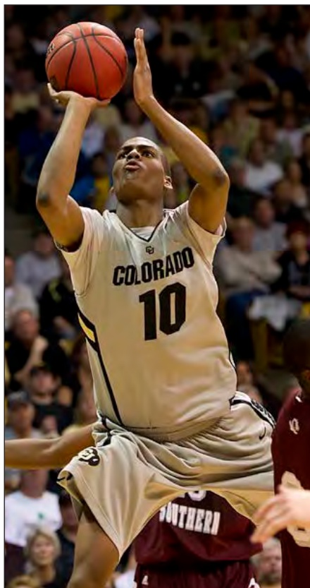
Alec Burks is the last player to make at least 250 field goals in a season (2010-11).