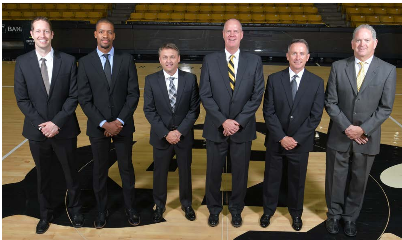
2018-19 University of Colorado Men's Basketball Coaching Staff