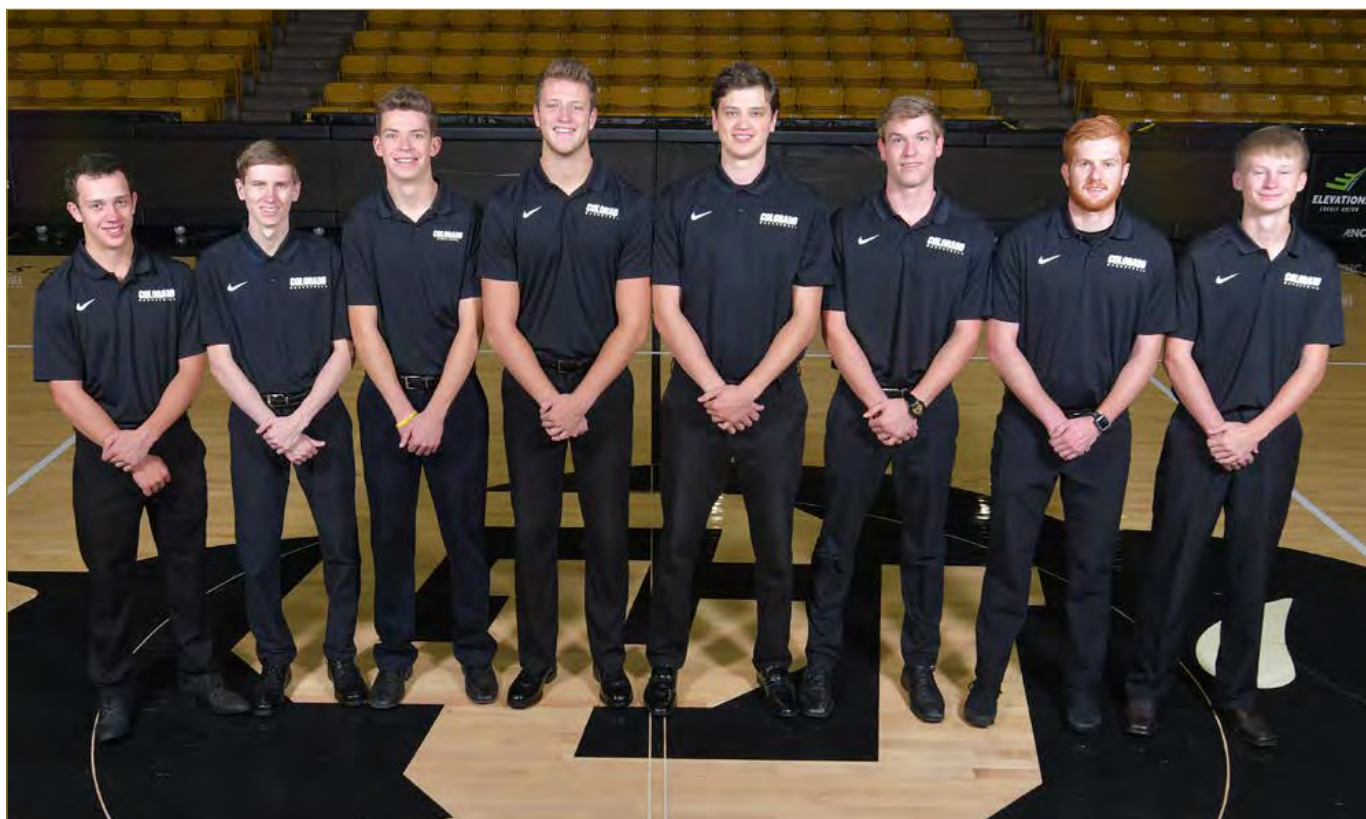
CU Basketball Managers