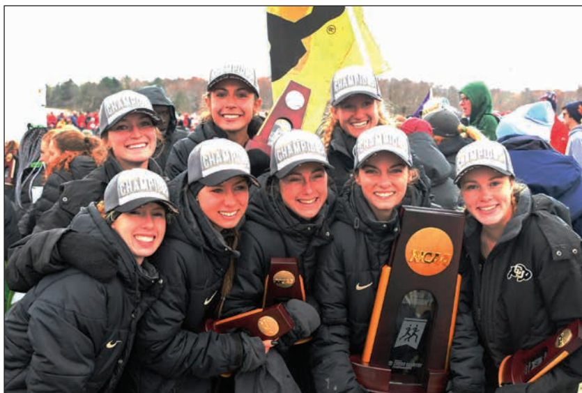
The CU women won the 2018 NCAA cross country title, their third overall.

Colorado added to its national championship count in 2018-19 with the school's third women's cross country crown, bringing the school's total to 28. The Buffaloes finished third in skiing, fourth in men's cross country, ninth in women's outdoor track and 16th in men's indoor track. CU has won 20 skiing titles (11 men's, one AIAW women's and eight coed) and eight cross country (five men's, three women's); the Buffs also were the consensus national champions in football in 1990, but since it is not an NCAA-sanctioned championship, it doesn't count toward the Pac-12's total of 526.