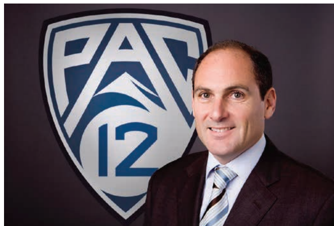
Pac-12 Commissioner Larry Scott

After a courtship of several months, Colorado accepted its invitation to join the Pac-12 on June 10, 2010, as the Buffaloes were the first domino to fall in a change of the national landscape. Within the next week, Nebraska also left the Big 12 to join the Big 10, Boise State departed the WAC for the Mountain West, and TCU jumped from the MWC for the Big East (before eventually landing in the Big 12). A week later on June 17, Utah agreed to join CU to make it an even dozen in the Pac-12. Big-time rivals for the first half of the last century, the Buffaloes and Utes officially became the 11th and 12th members of the Conference on July 1, 2011, the first additions to the league since 1978.